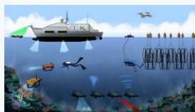
Maritime Robotics and Autonomous Systems