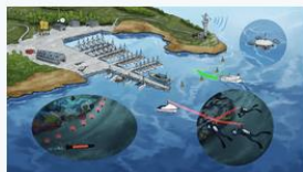
Maritime Internet of Things