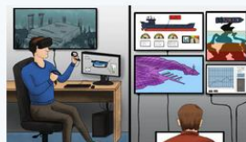
Maritime Digital Twins